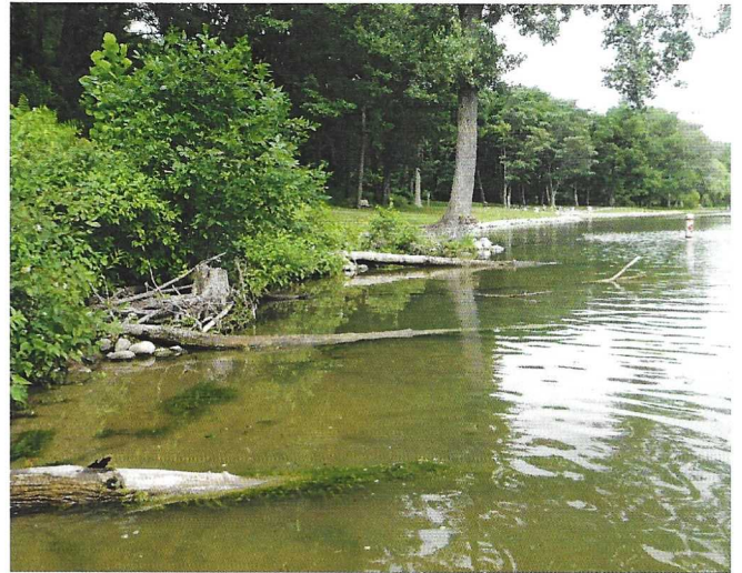
Coarse woody structure project installed as part of the Michigan Natural Shoreline Partnership Certified Natural Shoreline Professional (CNSP) Training.

Restore shoreline woody structure to the nearshore area of your lake. Root wads, logs, and whole trees can be installed as shoreline woody structure, but don't use trees that are currently growing near the shoreline, because they are stabilizing it from erosion. It is best to use recently live trees. The structure must be securely anchored. EGLE recommends placing woody structure 100 feet away from docks, boat ramps, and designated swimming areas. Below is one installation strategy that uses posts and cable to anchor trees to the shoreline.