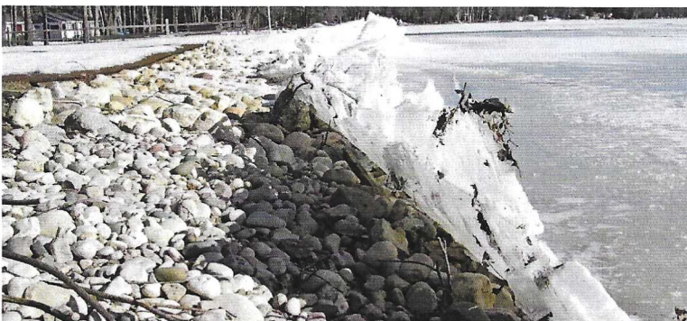
This higher-energy bioengineering project is protecting this shoreline from ice-push.