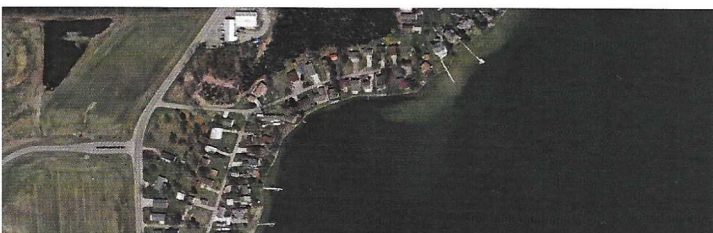
The pictures above compare the shoreline of a Michigan inland lake in 1938 (top) to the same shoreline in 2014 (bottom). Over-engineered shoreline stabilization (seawalls) are not only costly, they lead to poor lakeshore habitat.