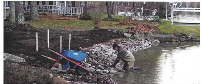
Biotechnical erosion control project being installed at a higher energy inland lake shoreline.