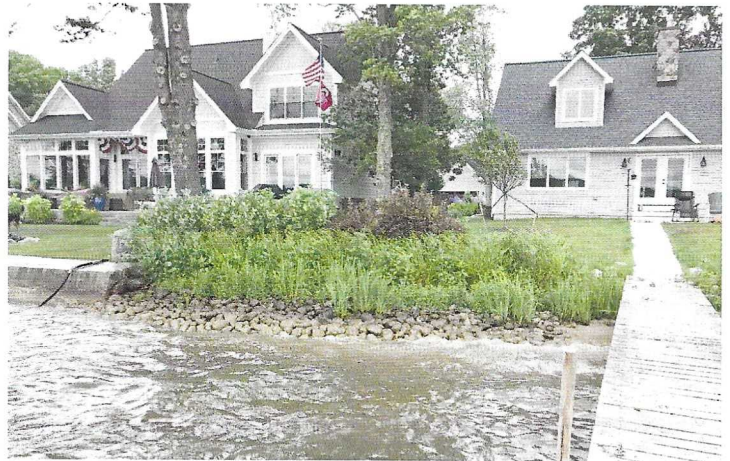
This bioengineering design protects the shoreline on this high energy lake by dissipating wave energy from wind and boats while still providing lake access and not impeding lake views.

The shallow-sloped fieldstone provides easy access to and from the water for frogs and turtles. Biotechnical erosion control also provides feeding habitat for fish, birds, butterflies, and other wildlife. This practice also deters property damaging geese!