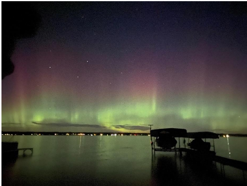
The northern lights (aurora borealis) as seen on West Twin Lake.

If you would like to receive the March, May and August newsletters only by email and November newsletter in the postal mail, please be sure to check the box at the top of the membership form in this newsletter.