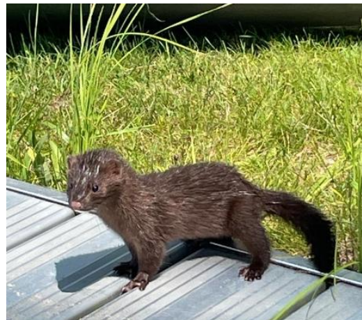
Mink on a West Twin dock

As TLPOA members and wildlife observers we need to continue to be respectful of the eagles' nest and other wildlife habitats.