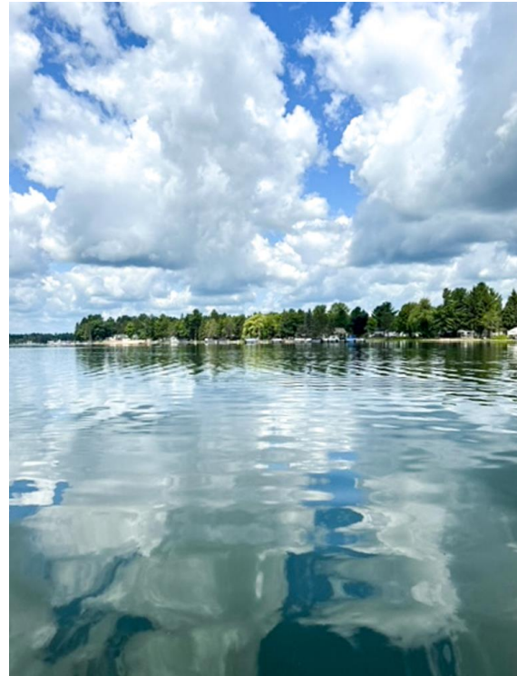
Photo of East Twin Lake

These initiatives help keep our lakes clean and healthy. What would the lakes do without us!